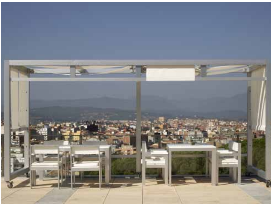
Perfect view over the city from the terrace of the Palau de Bellavista

Address: Nord, 2. Phone: +34 972 48 30 38. Price: from 100 € double. Web: www.hotel-ciutatdegirona.com