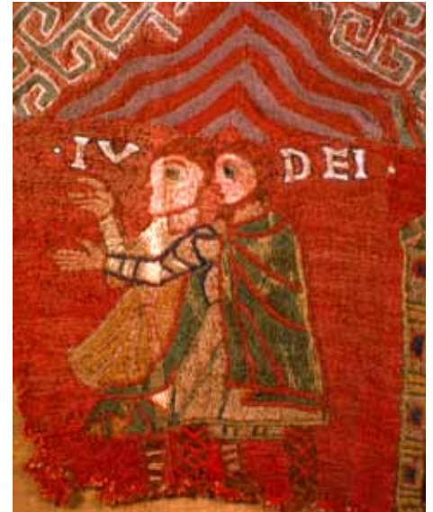
Tapestry of the Creation

This eleventh century embroidered tapestry is one of the great treasures of Girona Cathedral. The many scenes depicted include a Jewish couple, which have become the emblem