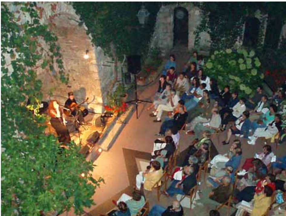
"Nights of Music in El Call ", Patio de la Estrella , Bonastruc ça Porta Centre

concert series "Nights of Music in El Call ". Through Sephardic, Hispanic Jewish and Medieval music, the area comes alive again with the sounds of centuries past when this was the district where the Jewish people of the city lived.