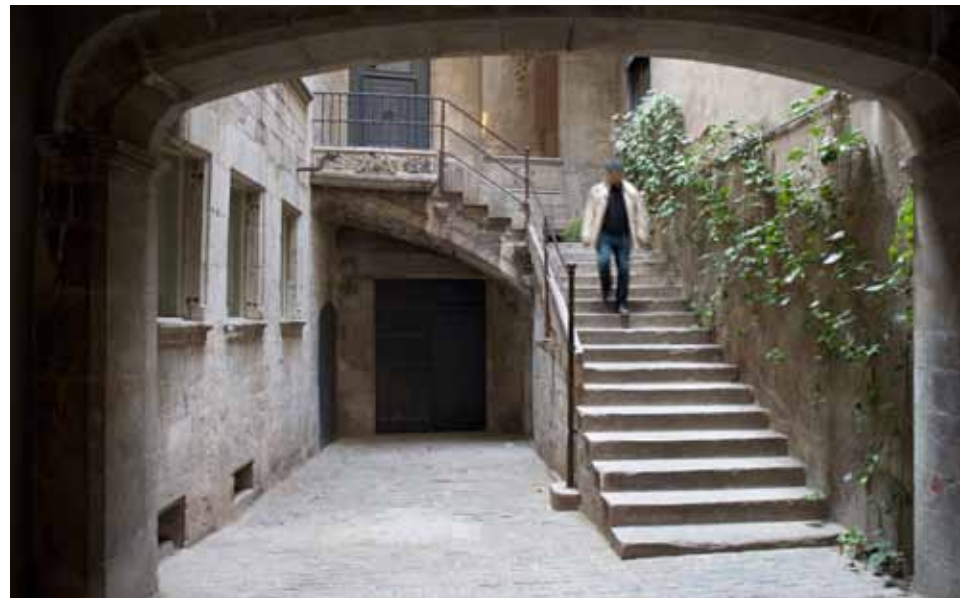
Calle Sant Llorenç