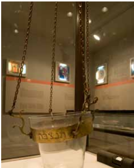
Jewish Votive Lamp (19th c.); Museum of Jewish History

An intriguing world. From the valuable collection of medieval tombstones from the Jewish cemetery of Montjuïc, to the reconstruction of the figure of the great kabbalist Nachmanides - Rabbi Moshe Ben Nachman, or Bonastruc ça Porta to give him his Catalan name - the Museum of Jewish History presents a broad and surprising view of the Jewish people, which is vital to understand the history of Girona. In addition, the centre is located in one of the three historic synagogues