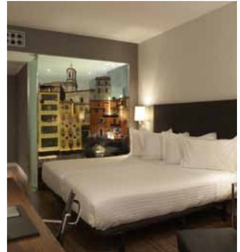
Room at the Palau de Bellavista

Address: Plaça Miquel Santalo, s/n. Phone: +34 972 21 12 12. Price: from 116 € double. Web: www.carlemany.es