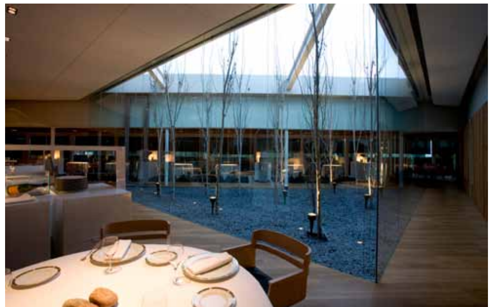
El Celler de Can Roca

Address: Hotel Carlemany. Plaça Miquel Santalo, s/n. Phone: +34 972 21 12 12 Price: 30 to 40 € Web: www.carlemany.es