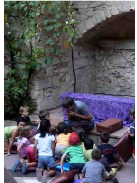
Children's storytelling session at the Bonastruc ça Porta Centre